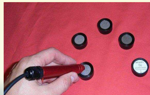
MF300Fe+ measuring the transfer standards

A variety of measurement modes are supported to ensure that good repeatable measurements can be made.